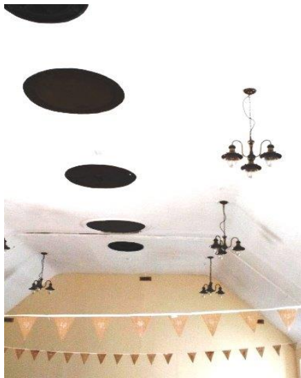
New Lighting in Town Hall